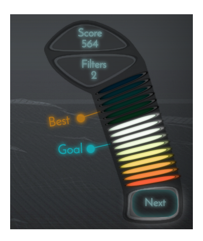
Figure 3 : The score widget of Binary Fission . The bar on the right fills up as a player's score increases. The teal Goal marker shows on the bar a baseline number of points a player must achieve to 'score' the problem. The orange Best marker on the bar shows what the current overall high score for that problem is. The Next button is not shown until the player's current score is greater than or equal to the goal score